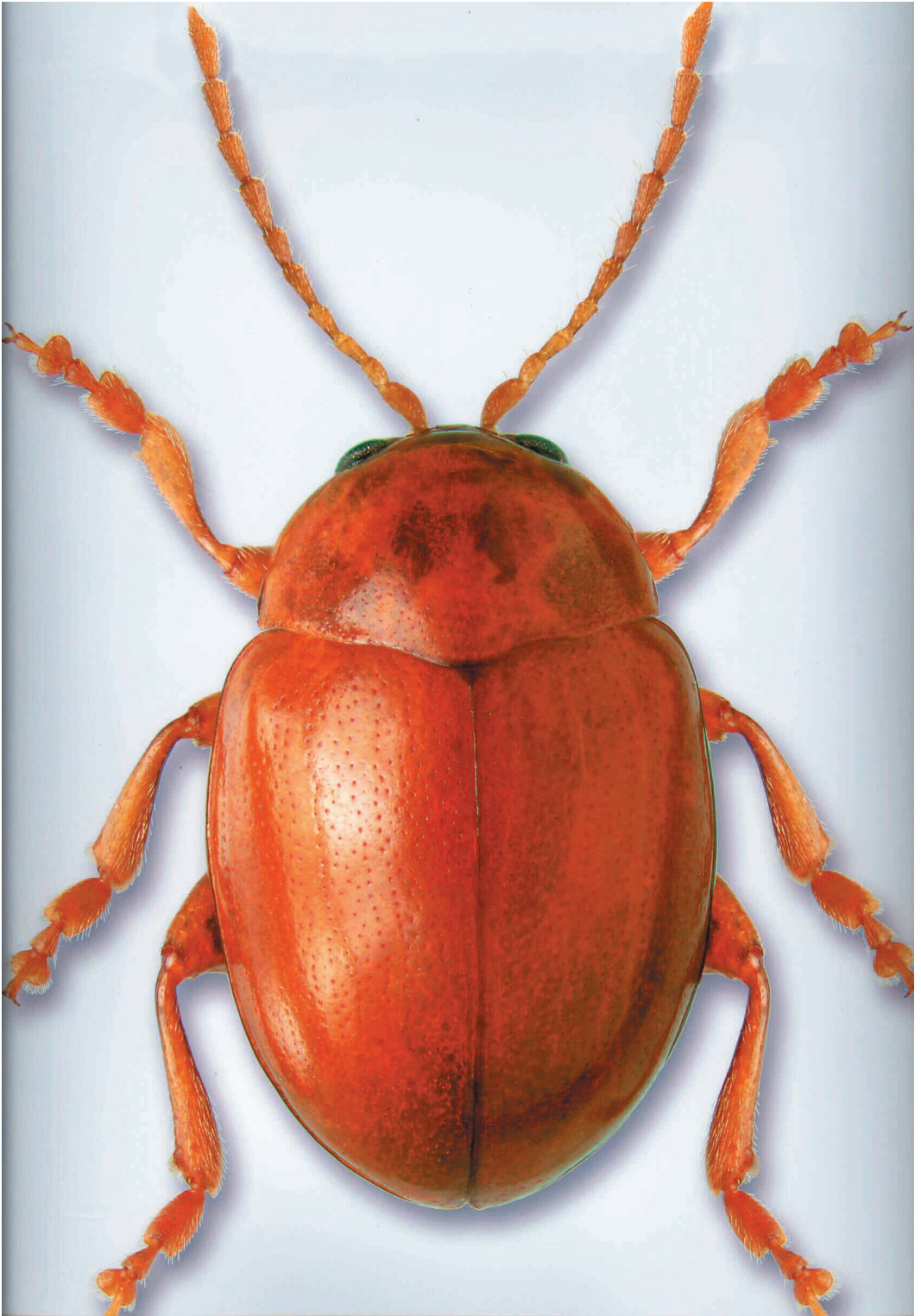
Fig1. Habitus photograph of Sphaeroderma testaceum (F.).