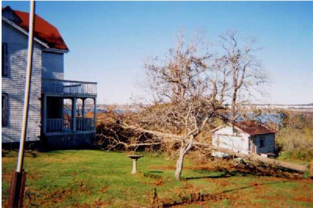
Trees down at the Lynch House