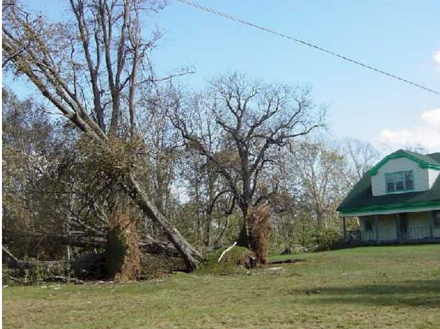
Damage to the Ornamental Linden trees flanking the walkway

trees were knocked down or damaged. The most extensive damage is in the north-end area between Garrison Road and the Old Military Road near where the old Findlay Picnic Grounds, school and fixed light would have been. The blowdown continued from the start of the Military Road up to the Lynch and Conrad houses. The other large area of blowdown is behind the Teahouse on the drumlin that runs the length of the island between the Timmins Cove Trail and Indian Point. The Fraser Farm Trail runs on top of this ridge and is extensively damaged.