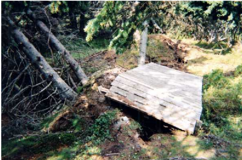
Tree roots heaving up decking