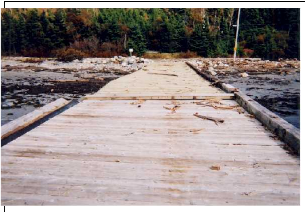
Garrison Pier showing heaved deck boards