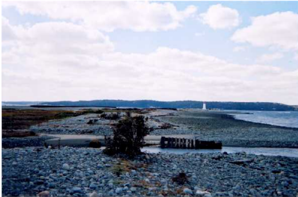
The breach in Maughers Beach