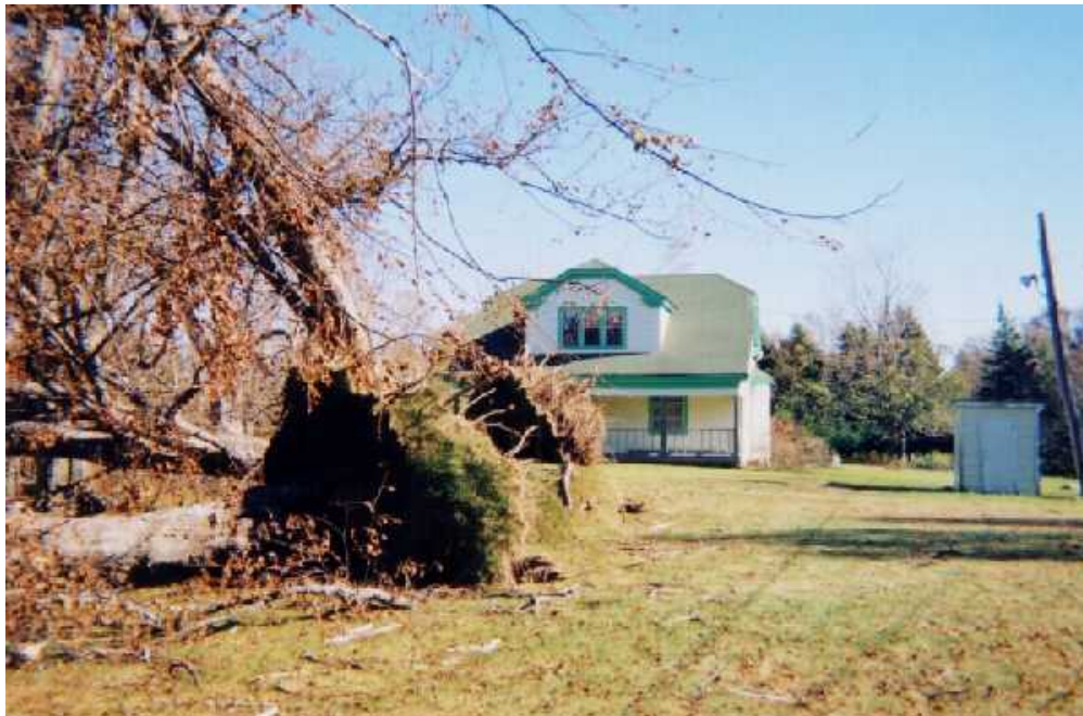
Trees down on the lawn of the Davis House